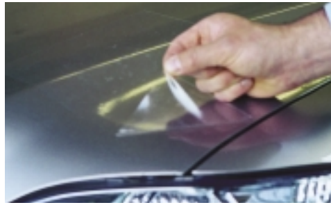
Optical clarity and high gloss

You can't see it, yet VentureShield™ is so tough it's used for abrasion protection on aircraft propellers and rotors!